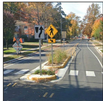
Median island example