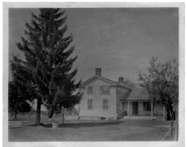
Above two photos are of the Goodwin's farmhouse sometime after they had moved off of the farm.